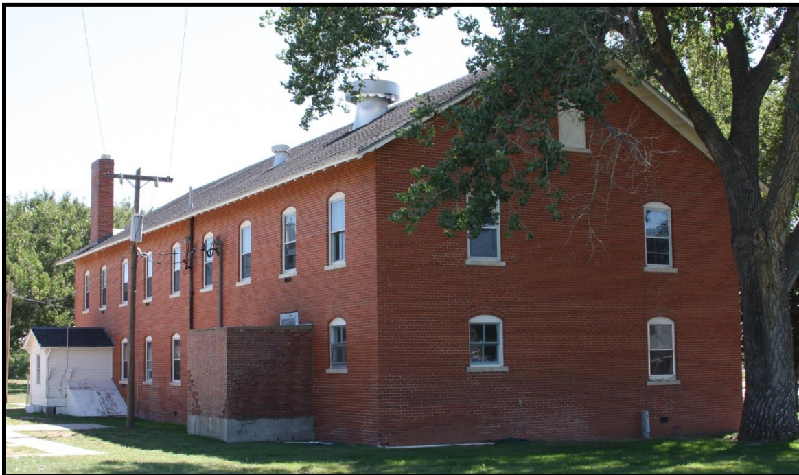
Photograph 2: View of the northwest corner of Building 347 (Photograph by T. Beckwith).