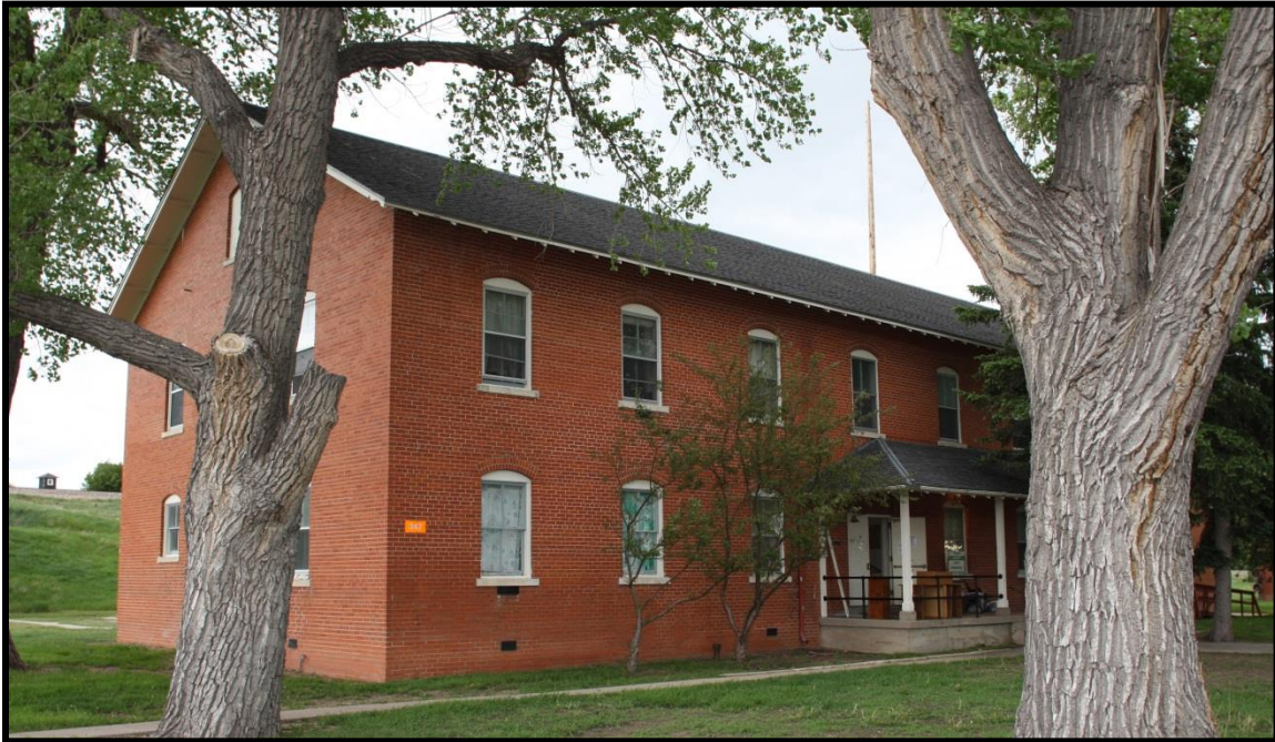
Photograph 1: View of the southwest corner of Building 347.